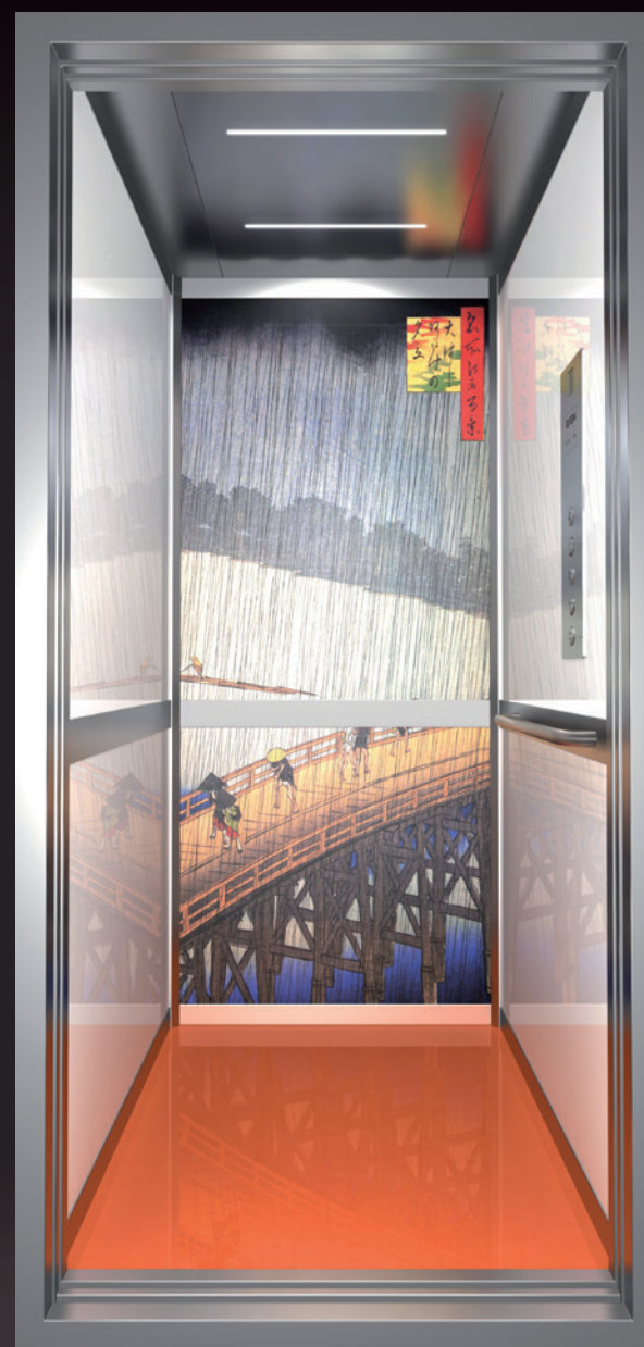
MOD DINAMIC M/L