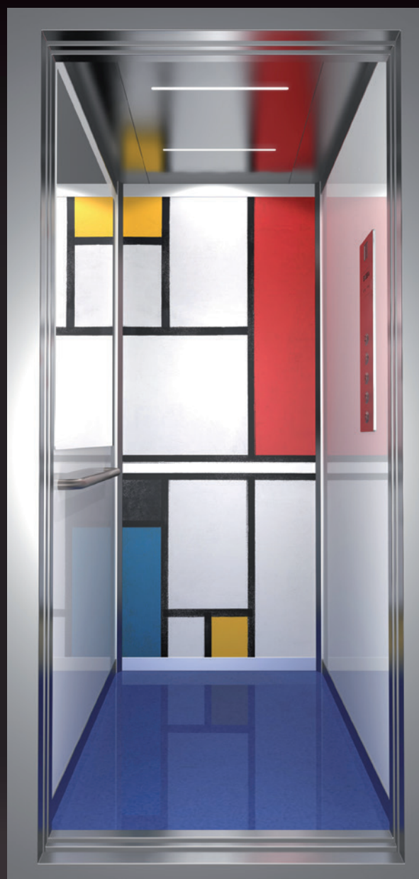
MOD OPTIMA M/L