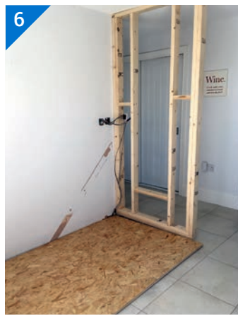
6 The solution was to slightly lower the floor in front of the lift rather than the costly option of raising the ceiling above the shaft