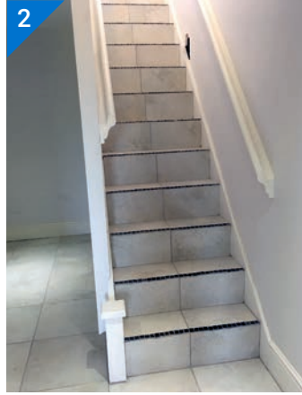
2 Introduction of the domestic platform lift was to allow easy access down to the storage area and garage on the lower floor