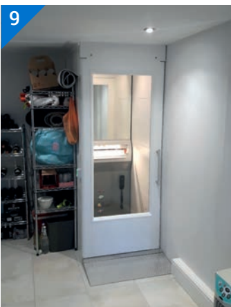
9 The final domestic platform lift installation in the lower storage area of the residence at hand over by Landmark Lifts and Builders CPM