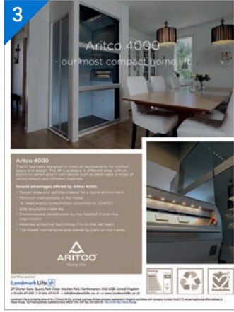
3 The Aritco 4000 platform lift was specified by Landmark Lifts to meet the project requirements for the domestic installation