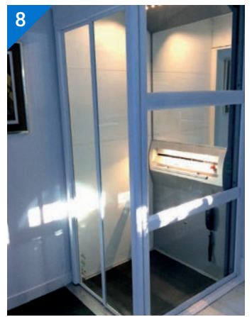
8 Additional vinyl flooring was ordered via a UK stockist allowing the new flooring on the ground level to match the flooring in the lift