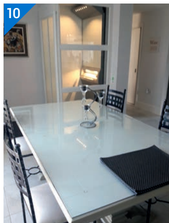
10 The fully commissioned Aritco 4000 domestic platform lift installation in the kitchen on the ground floor of the residence