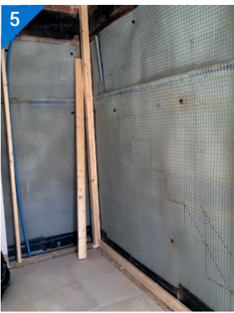
5 The staircase was removed and the lift shaft was built to overcome the issue of insufficient head room for the chosen model