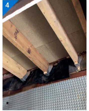
4 On-site building work exposed the lower level ceiling so a hole could be cut out to allow construction of the platform lift shaft