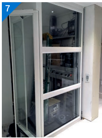
7 The Aritco 4000 installation begins with the electric supply being wired in and full testing and commissioning of the lift completed